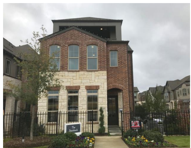
New residential developments at Lake Highlands Town Center that opened in 2018 including Lookout Apartments (left) and Enclave townhomes (right)