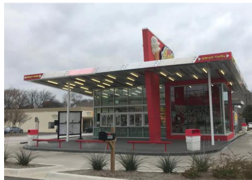
Taco Diner at the Shops at Lake Highlands Town Center (left) and Andy's Frozen Custard (right) at the upgraded "White Rock Place" retail center.