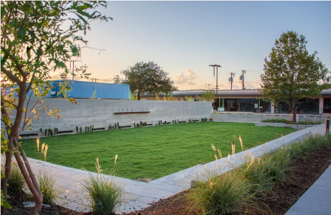
Lakeridge Shopping Center