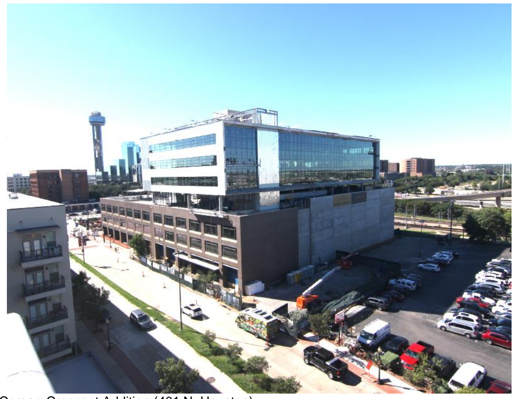
Corgan-Crescent Addition (401 N. Houston)