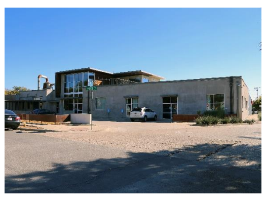
The Olympia Arts Building