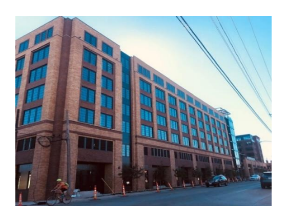
Novel Deep Ellum (Crescent)