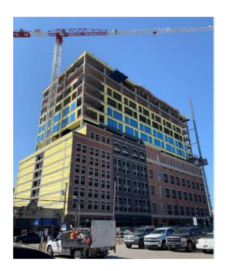
The Stack Deep Ellum

The chart that begins on page 7 is a comprehensive list of all TIF funded and significant non-TIF funded projects within the Deep Ellum TIF District.