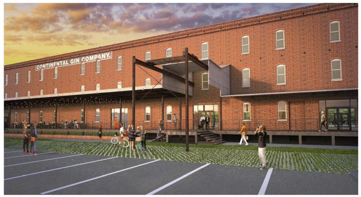
Continental Gin Redevelopment Project