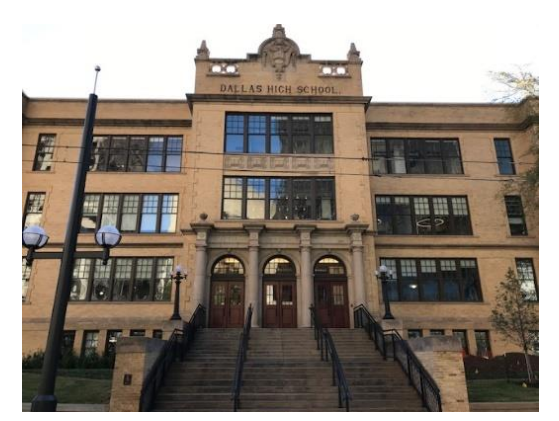
Old Dallas High School