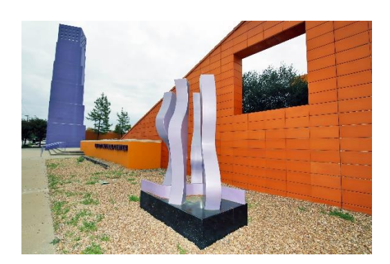
Latino Cultural Center