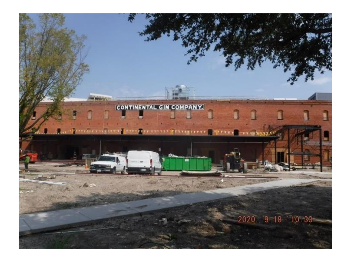
The Continental Gin Building