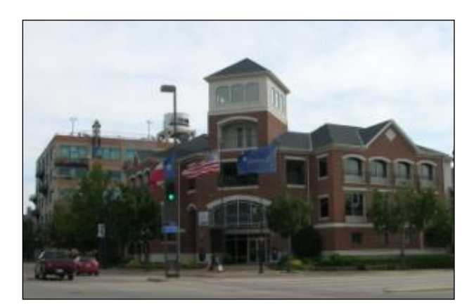
Camden Phase 1A apartments

summer of 2000. Public improvements for Phase II include streetscape improvements, street lighting, wastewater and water improvements.