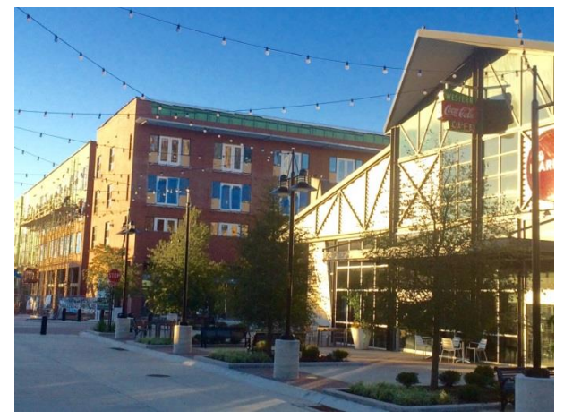
Street view between Taylor Building and Farmers Market Shed 2 Harvest Lofts (Shed 3 and 4) in distance