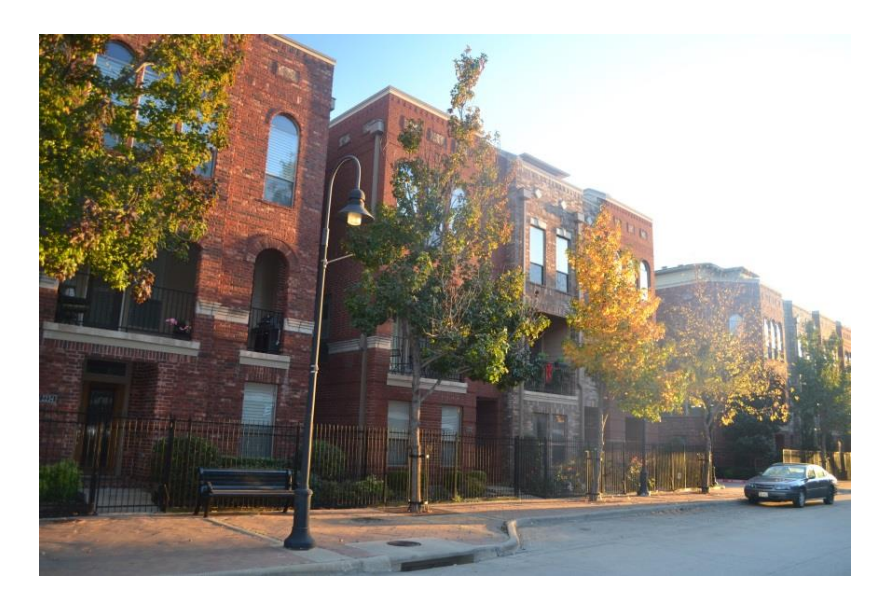
Perry Homes – Cityview at Farmers Market

Perry Homes constructed 44 three-story townhomes - the Farmers Market Way Townhomes (Cityview at Farmers Market Townhomes) at the corner of Farmers Market Way and Cesar Chavez Boulevard.