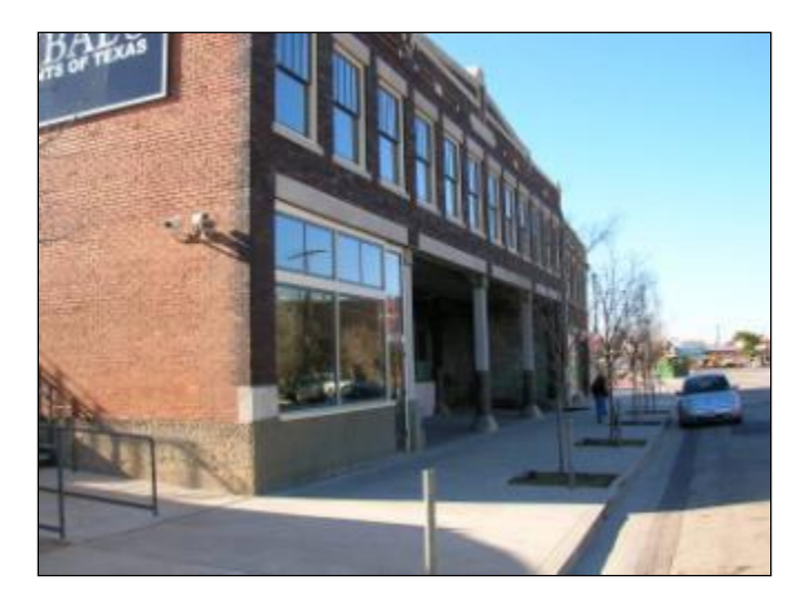
The Harlan Building

The Harlan Building was completed in 2005. The renovation of the structure provides 10,000 square feet of retail/commercial space and 5 residential units. The public improvements associated with the project included water and wastewater improvements, paving, streetscape, demolition, environmental remediation and façade improvements.