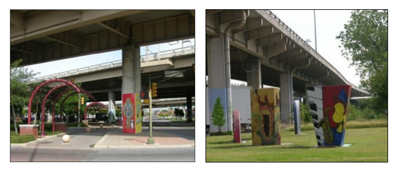
Farmers Market/ Deep Ellum Connector Walkway

The Farmers Market/Deep Ellum Connector Walkway provides connectivity from the District to the Deep Ellum entertainment district and was completed in 2002. Improvements such as lighting and benches in conjunction with the Bark Park Central project were completed and banners were installed in 2004. Deep Ellum Foundation, with the support of Farmers Market TIF funds, added lighting to the Art Park and commissioned new art work.