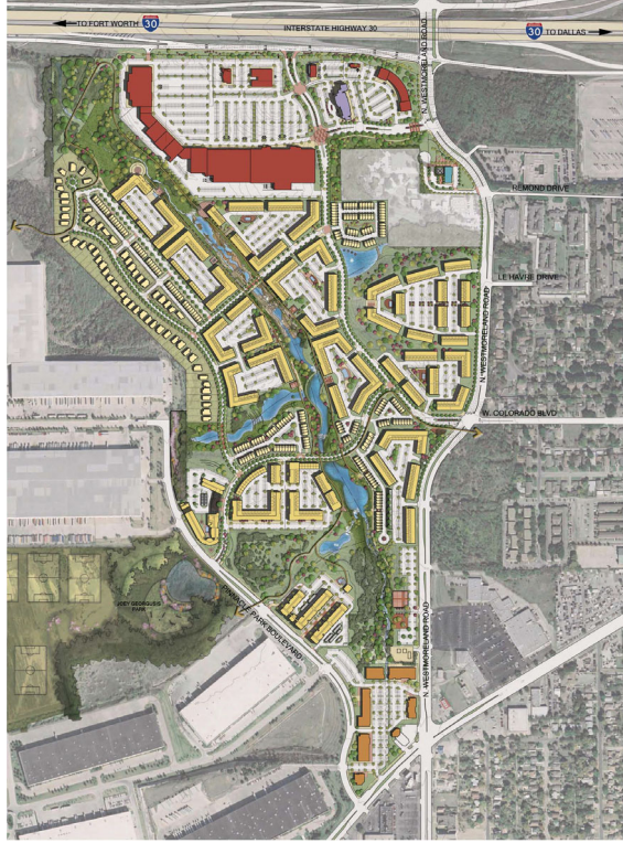
The Canyon in Oak Cliff - Conceptual Site Plan