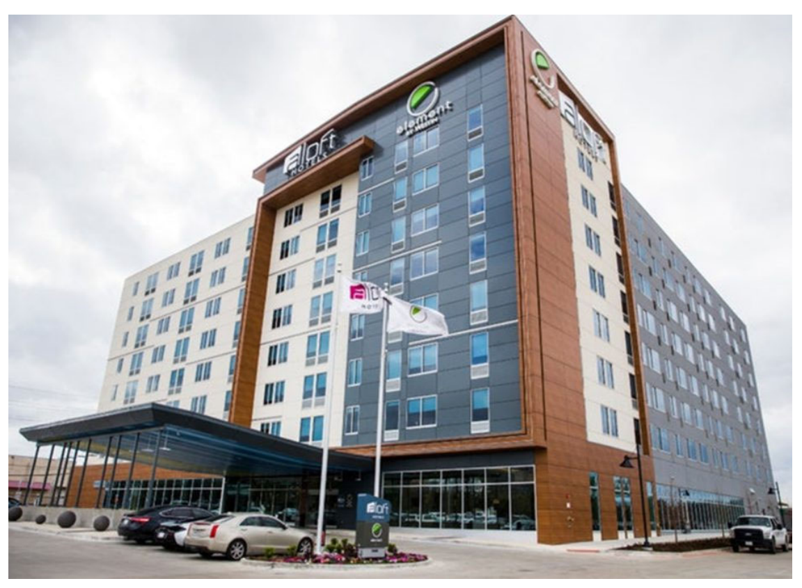
aLoft/Element - Love Field Hotel