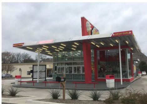
Taco Diner at the Shops at Lake Highlands Town Center (left) and Andy’s Frozen Custard (right) at the upgraded “White Rock Place” retail center.

Upgrades were made at the Kingsley Square and Medallion Center. A WalMart Supercenter and the Timbercreek Crossing development is complete with Wal Mart/Sam’s Club as an anchor. The White Rock Place project included upgraded signage and site improvements as part of consolidating viable retail space that attracted new tenants. The Shops at Lake Highlands Town Center includes a Sprouts grocery anchor along with new restaurants and retail. An additional 181,993 square feet in retail space, including a Marshalls, Burlington and Academy, was added to the TIF District with the development of Highpoint Crossing in 2018.