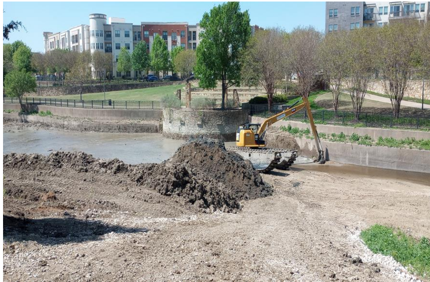
Watercrest Park Pond Dredging Project