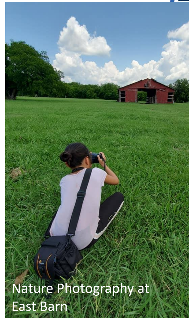
Nature Photography at East Barn