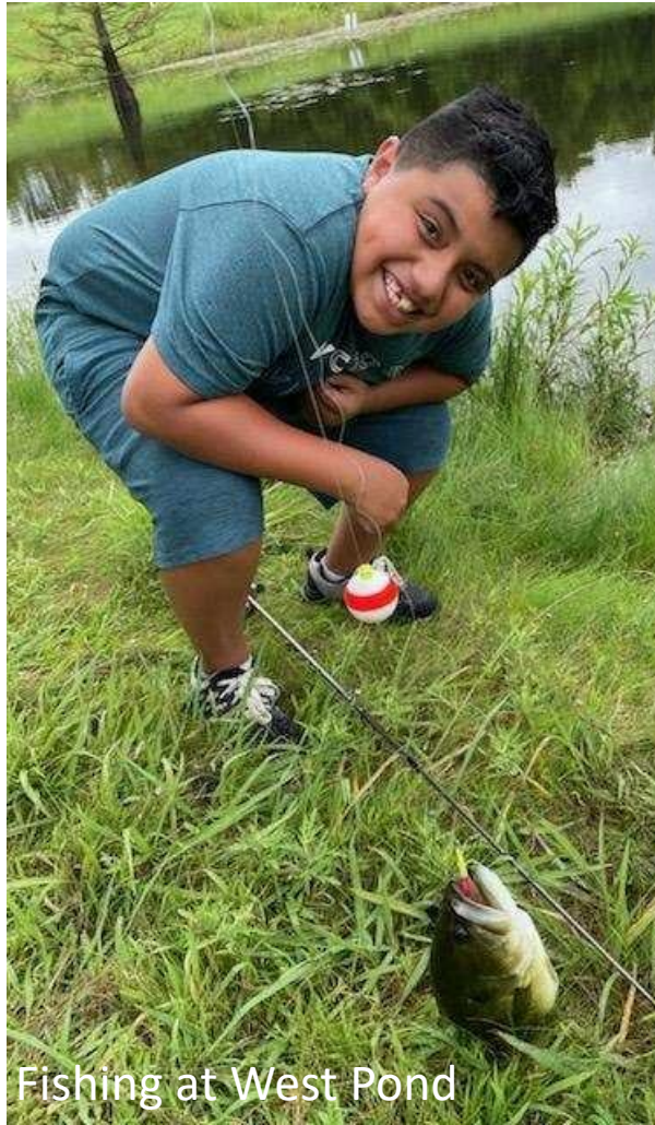
Fishing at West Pond