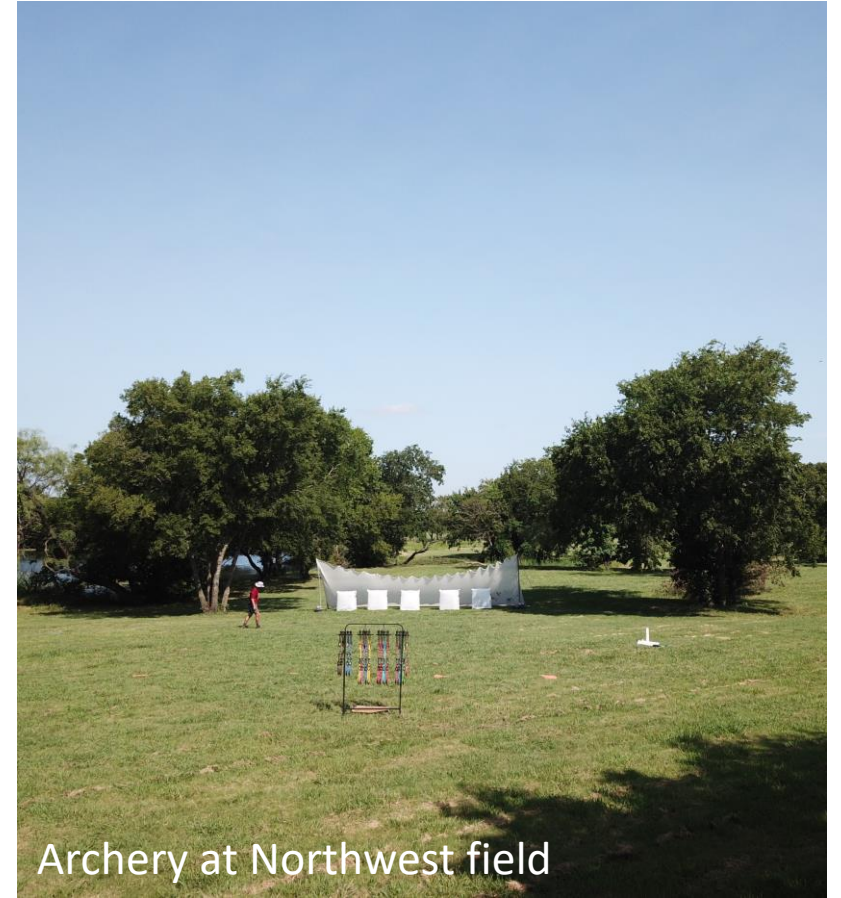
Archery at Northwest field