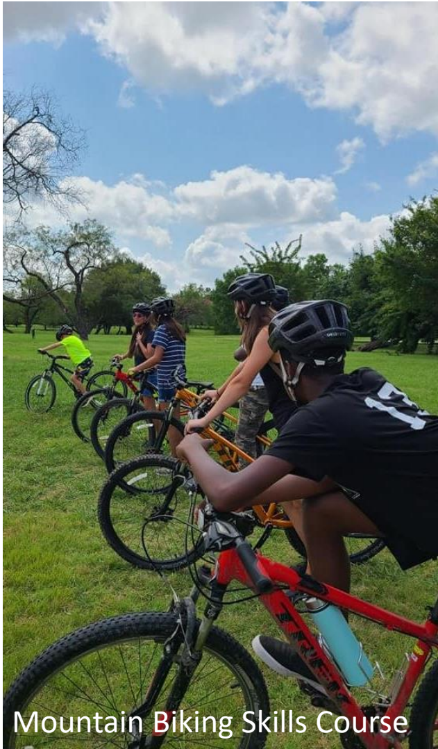
Mountain Biking Skills Course