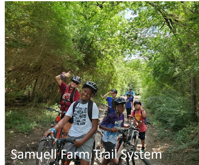
Samuell Farm Trail System