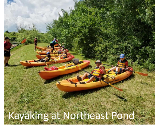
Kayaking at Northeast Pond