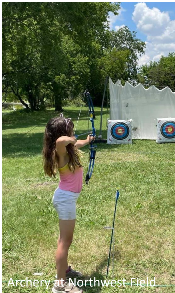
Archery at Northwest Field