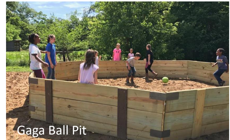
Gaga Ball Pit