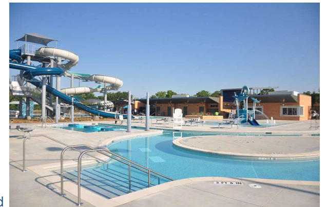
The Cove at Crawford