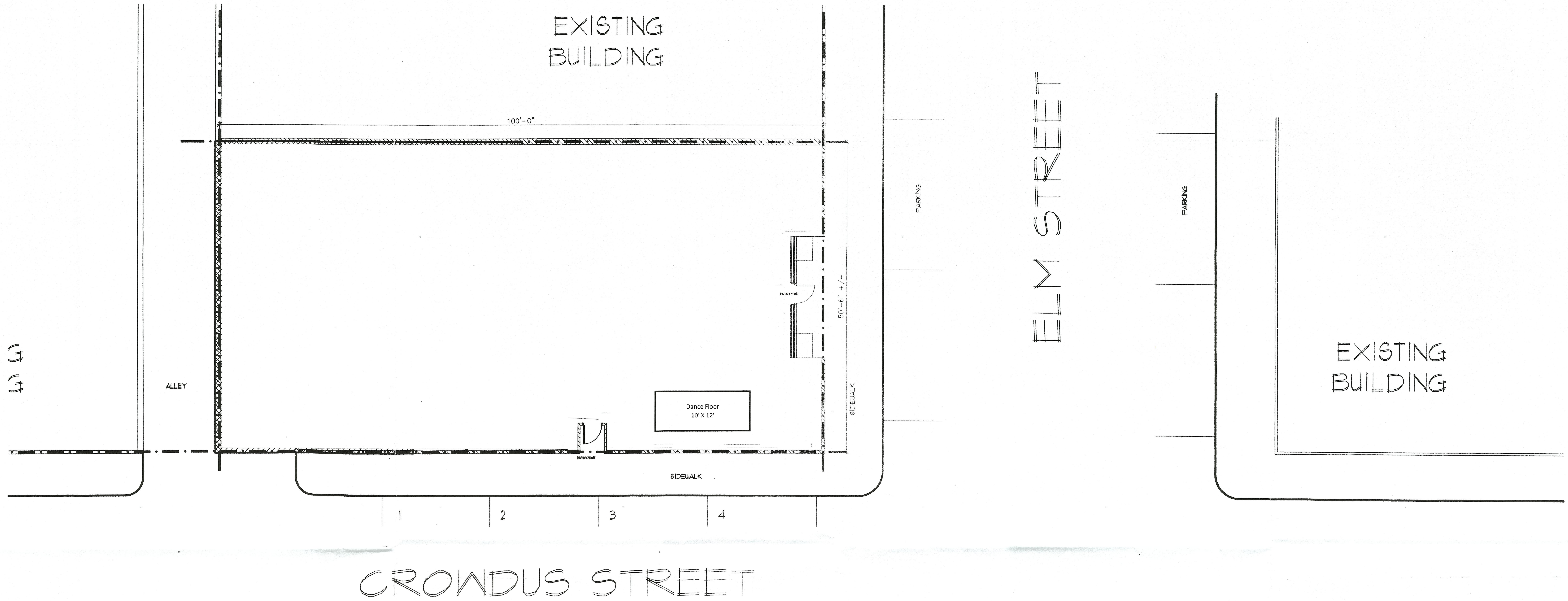
03 SUP Site Plan 1/8" = 1'-0"