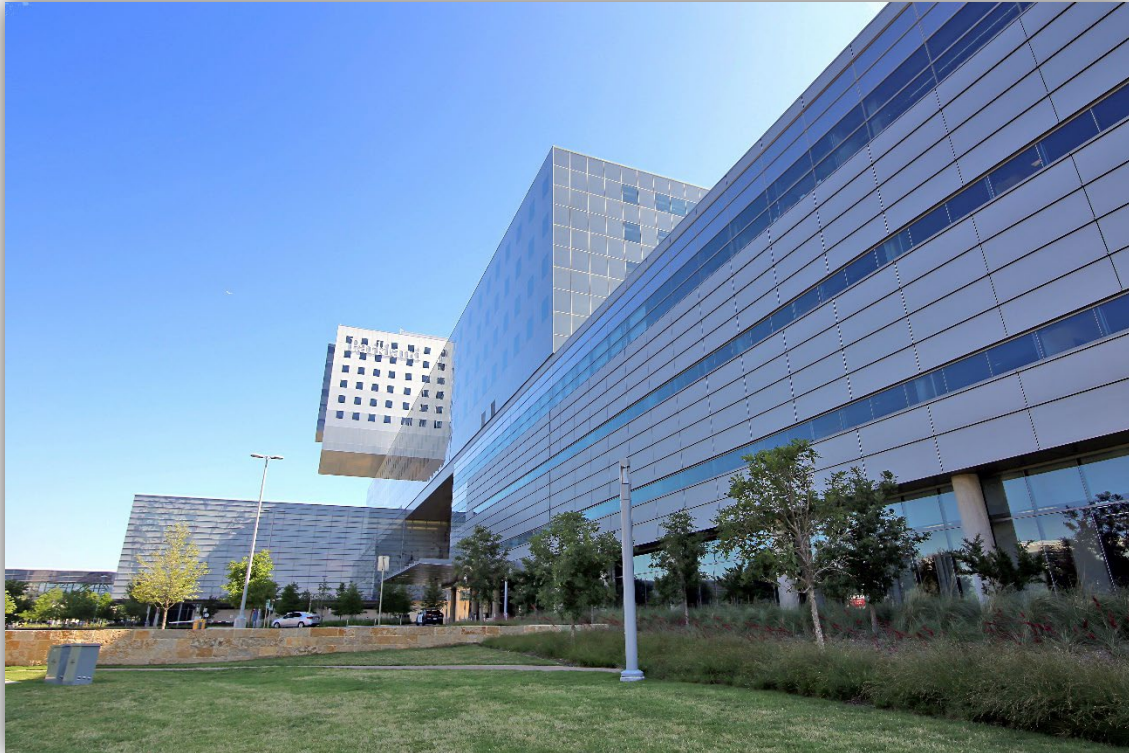
Exhibit A Southwestern Medical TIF District FY 2021-2022 Annual Report