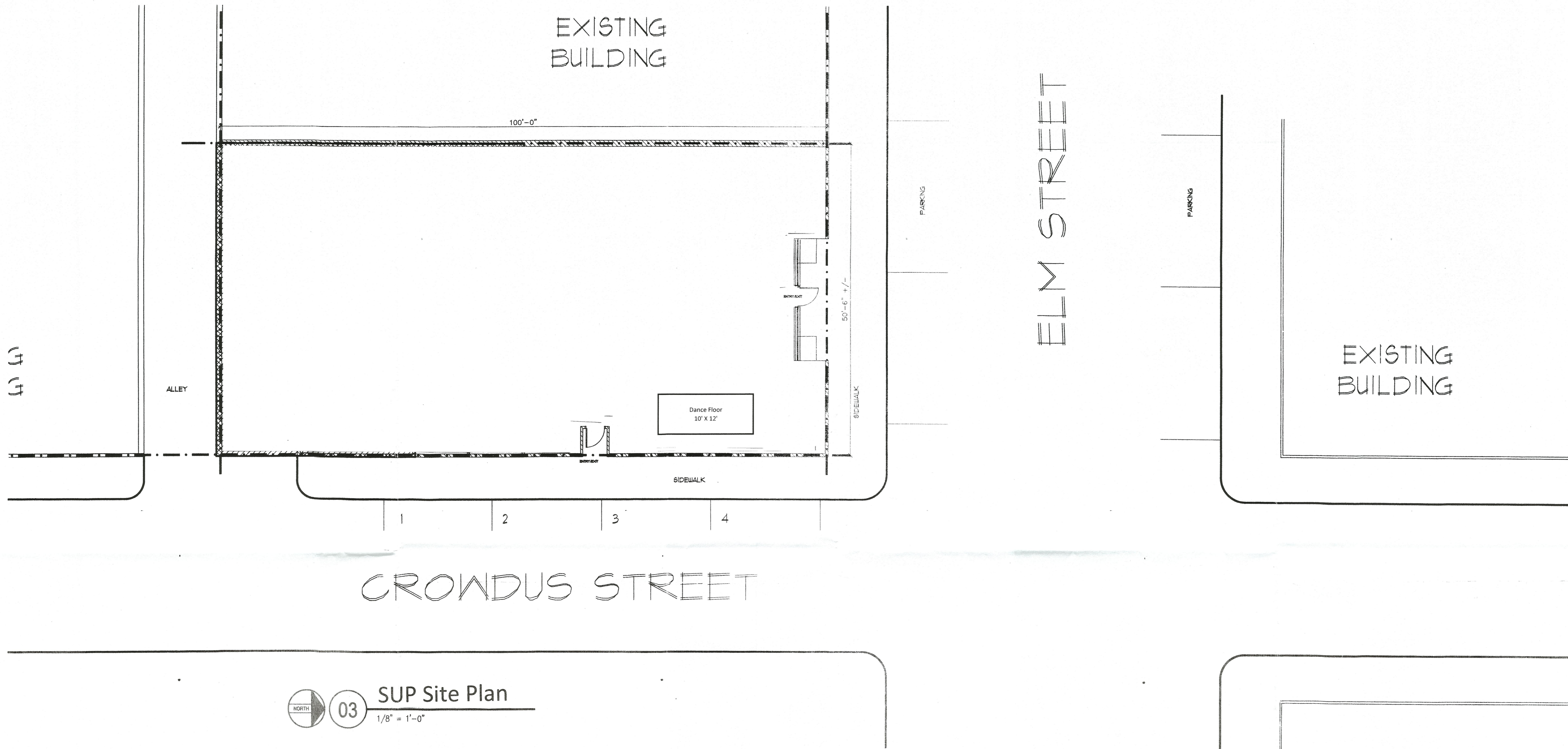
03 SUP Site Plan 1/8" = 1'-0"