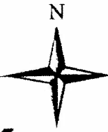
Exhibit "B" Description of Escarpment Park