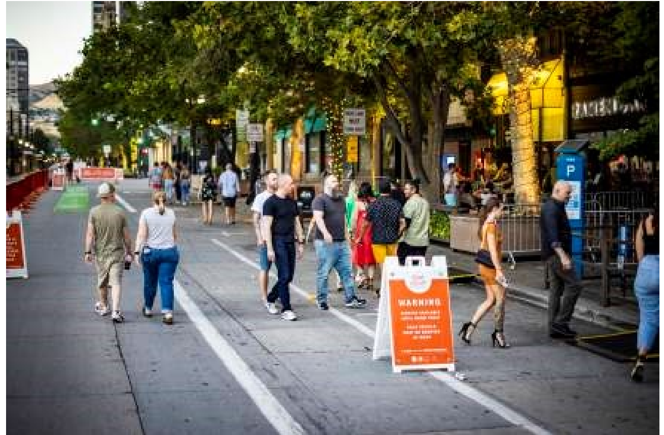
Salt Lake City's Open Streets