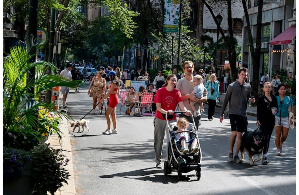
Philadelphia's Open Streets