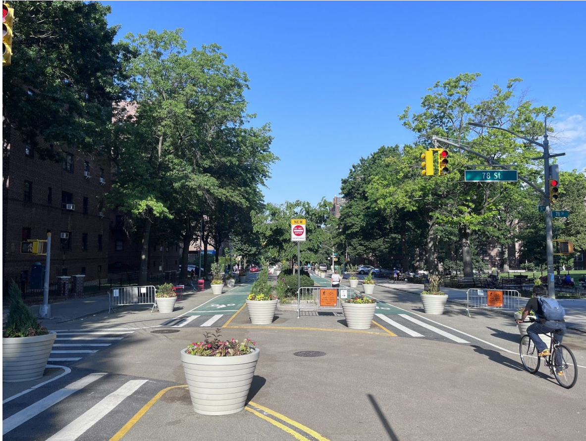
New York City's Open Streets