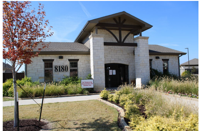
University Center Sub-District development – community amenities