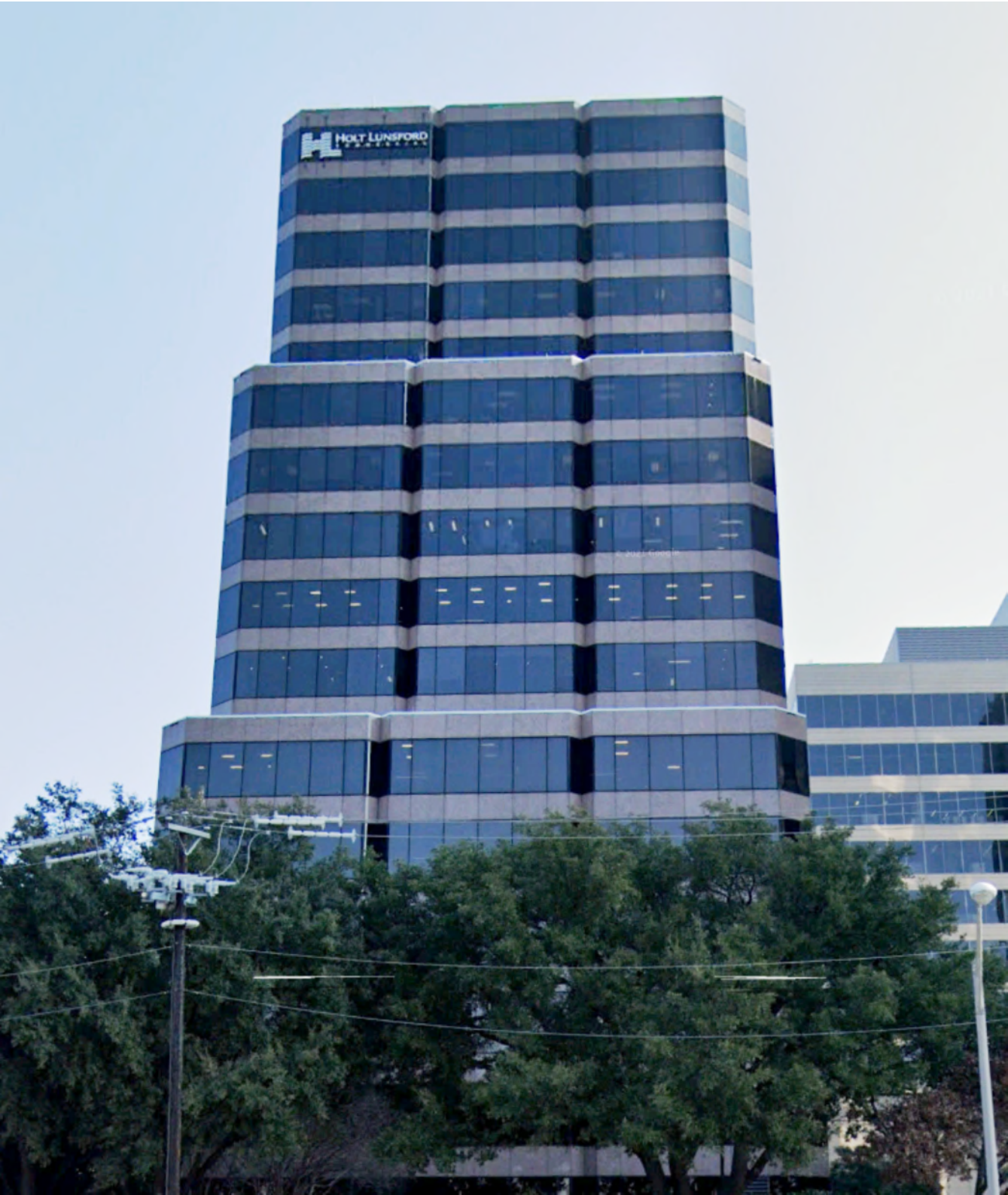
EXISTING ELEVATION NO PRIOR WORK REQUIRED