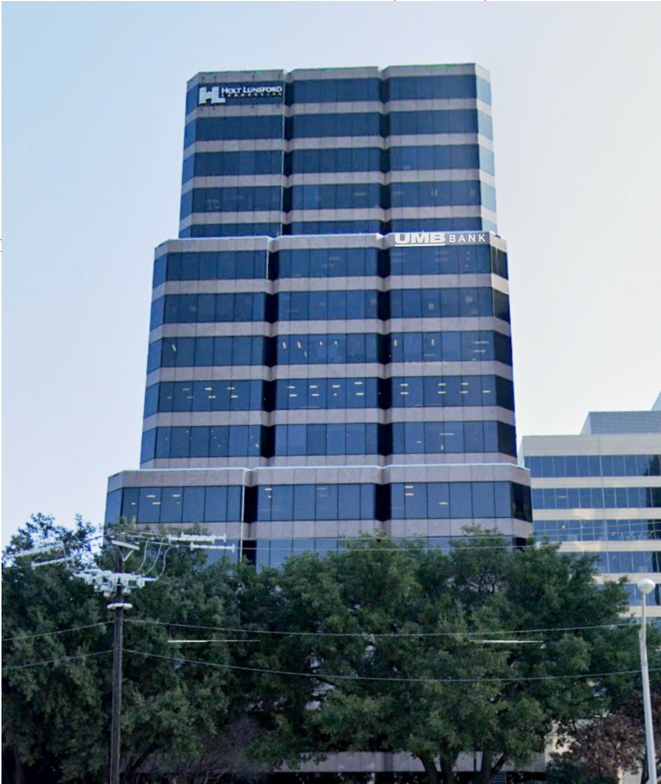
B PROPOSED NON-ILLUMINATED REVERSE CHANNEL LETTERS ONE [1] SET REQUIRED - MANUFACTURE & INSTALL