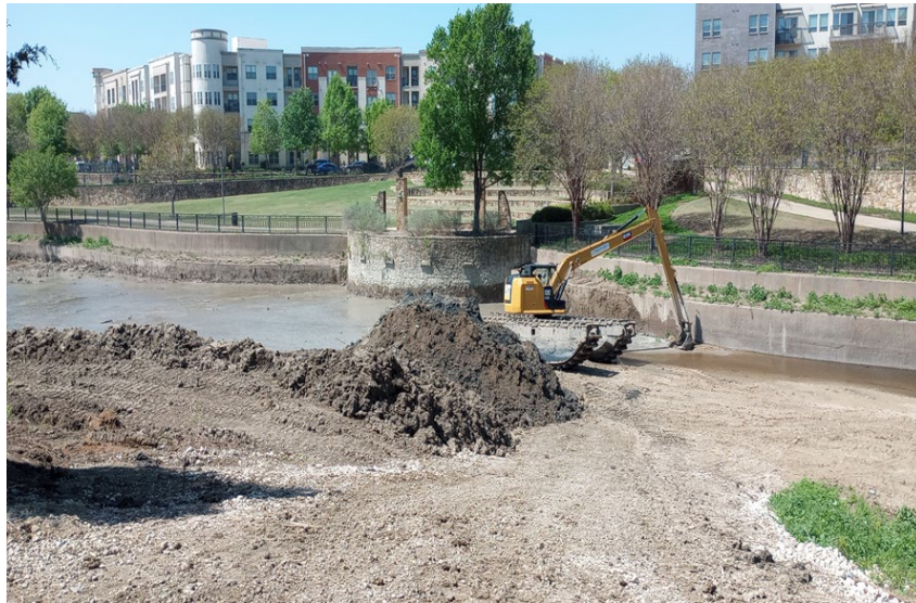
Watercrest Park Pond Dredging Project