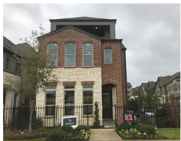
Residential developments at Lake Highlands Town Center that opened in 2018 including Lookout Apartments (left) and Enclave townhomes (right)