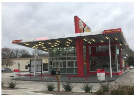
Taco Diner at the Shops at Lake Highlands Town Center (left) and Andy's Frozen Custard (right) at the upgraded "White Rock Place" retail center.

Upgrades were made at the Kingsley Square and Medallion Center. A WalMart Supercenter and the Timbercreek Crossing development is complete with Wal Mart/Sam's Club as an anchor. The White Rock Place project included upgraded signage and site improvements as part of consolidating viable retail space that attracted new tenants. The Shops at Lake Highlands Town Center includes a Sprouts grocery anchor along with new restaurants and retail. An additional 181,993 square feet in retail space, including a Marshalls, Burlington and Academy, was added to the TIF District with the development of Highpoint Crossing in 2018.