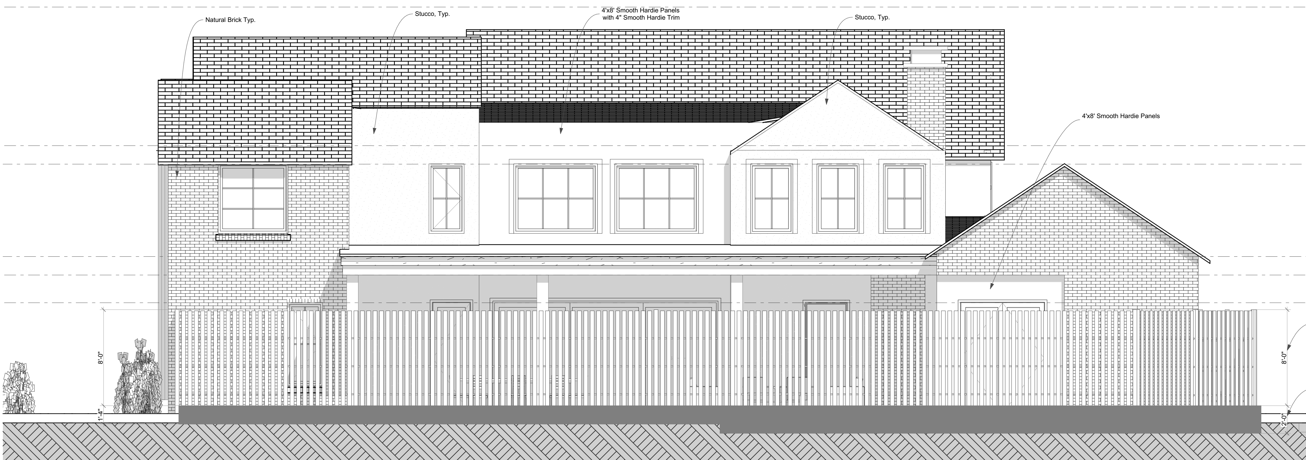
1 RIGHT ELEVATION SCALE: 1/4" = 1'-0"