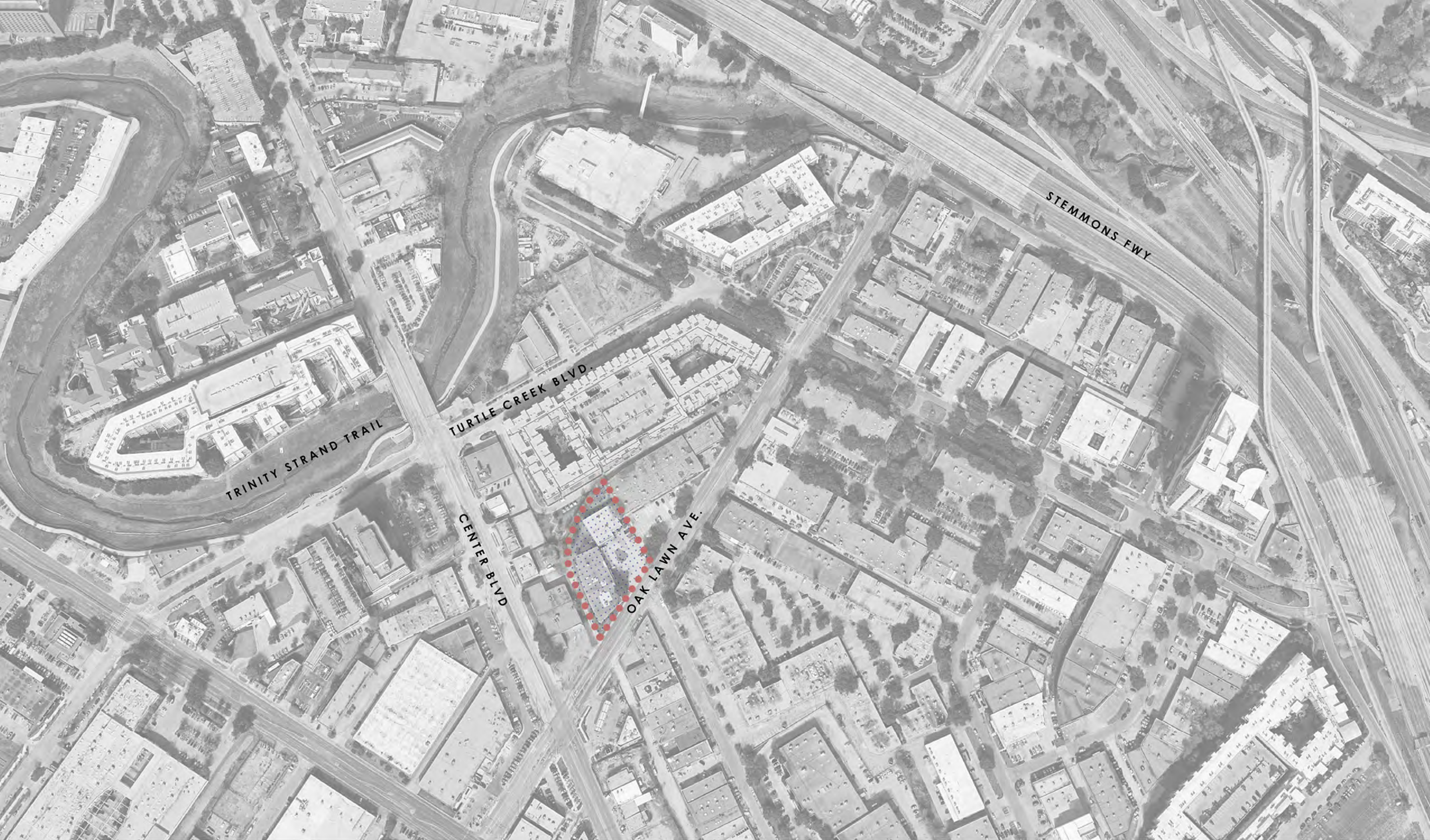
VICINITY MAP | 1333 OAK LAWN