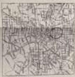
Site Map March 1997 4th Edition