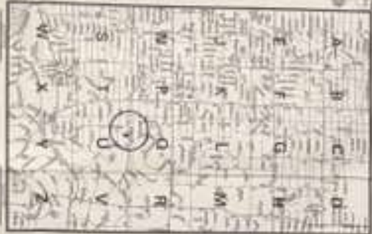
Site Map March 1997 4th Edition