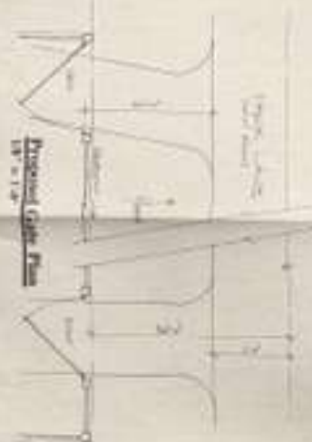
Proposed Elevation 1/8" = 1'-0"