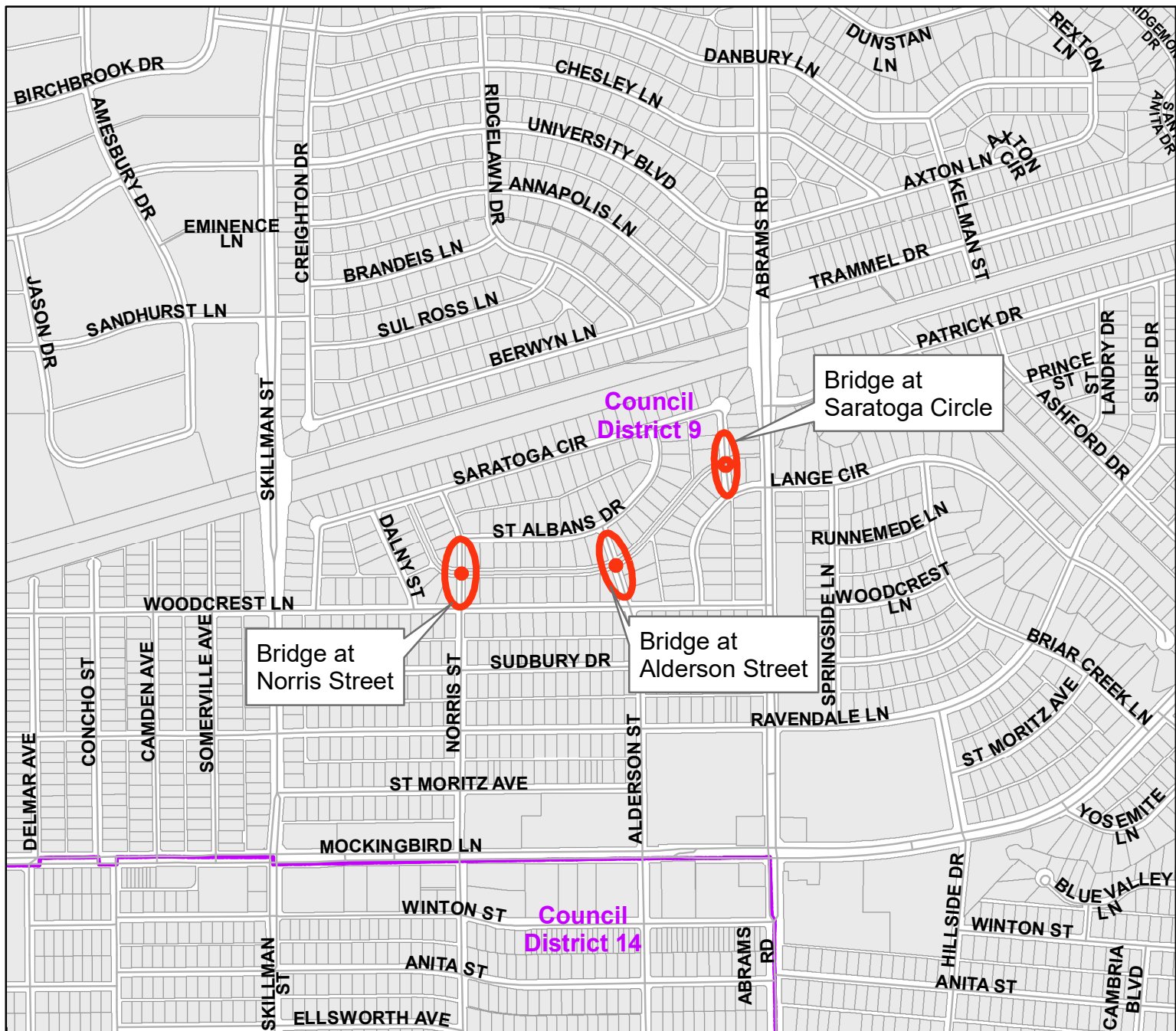
Norris Street/Alderson Street/Saratoga Circle Bridges