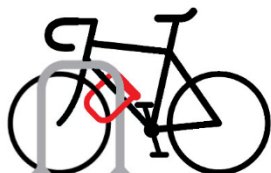
Figure DEF - A single U-lock securing both a wheel and the bicycle frame.