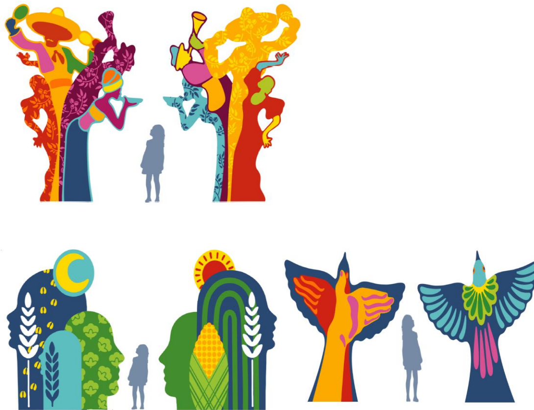
Image of Design Concepts