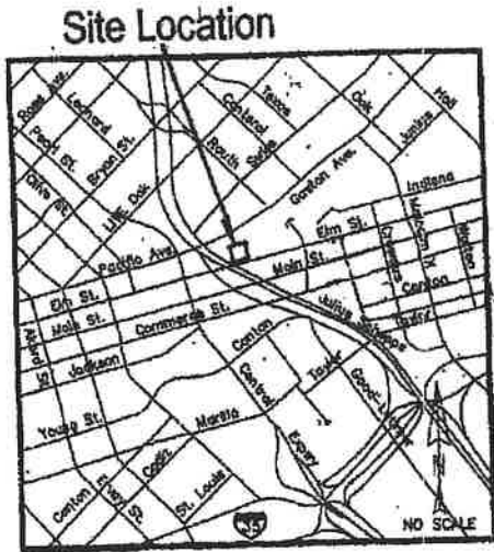
VICINITY MAP NTS