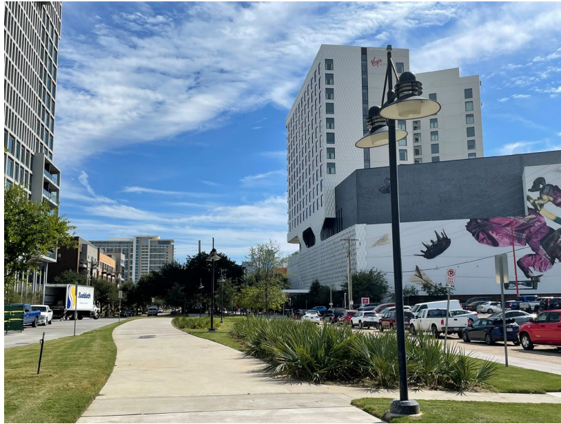
Hi Line Drive median improvements setting the stage to connect with the future Hi Line Connector and Trinity Strand Trail Hi Line Span projects