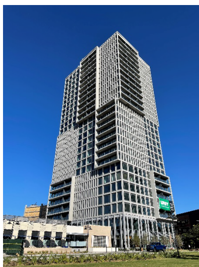
Urby Apartments Phase I nearing completion at 1930 Hi Line Drive

A total of 2,294 residential units have been completed overall. Another 997 units are under construction or planned without any TIF district subsidy anticipated.