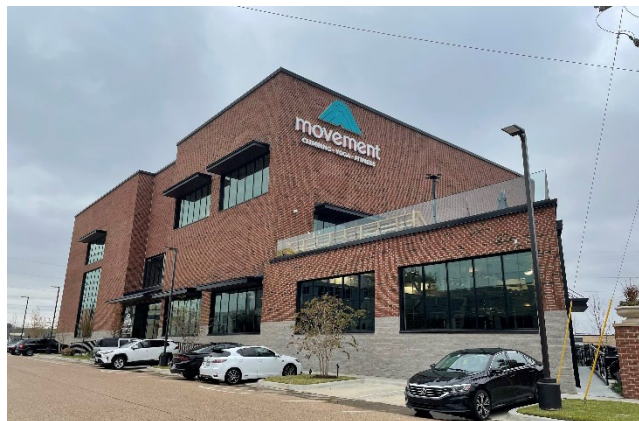
Movement Dallas - rock climbing, yoga, and fitness facility at 141 Glass Street

Approximately 3,291 residential units, 266,813 square feet of new or upgraded retail/showroom space, 13,520 square feet of gallery/arts space, 559,075 square feet of office space, and 782 hotel rooms are completed, under construction or planned. (73% of the residential goal, 20% of the retail goal, exceeding the office goal by 12%, and exceeding the hotel room goal by 42%.