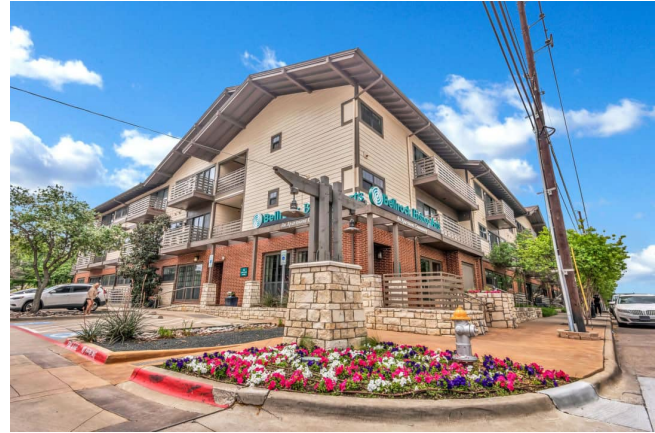
Bell Bishop Arts Apartments

Since the TIF District's creation, City Council has approved TIF District funding for 11 projects in the TIF District. This includes SLF III – Davis Garden TIF, L.P.'s (SLF) horizontal development project, which resulted in the demolition of 1,503 outdated apartment units in accordance with the TIF District's goal to replace 2,100 functionally obsolete apartments and 85,000 square feet of commercial space with approximately 2,200 for-sale units, 4,400 rental units and 663,300 square feet of improved, reconfigured or new neighborhood retail space. To date, 528 residential units have been constructed or are under construction on these sites. Development of the newly created development sites, such as the Bell Bishop Arts Apartments, is anticipated to further improve north Oak Cliff's successful residential market as well as stimulate the expansion of residential and commercial activity throughout the TIF District. Several conversions of automobile repair garages to restaurant and retail space have also occurred along West Davis Street in the TIF District.