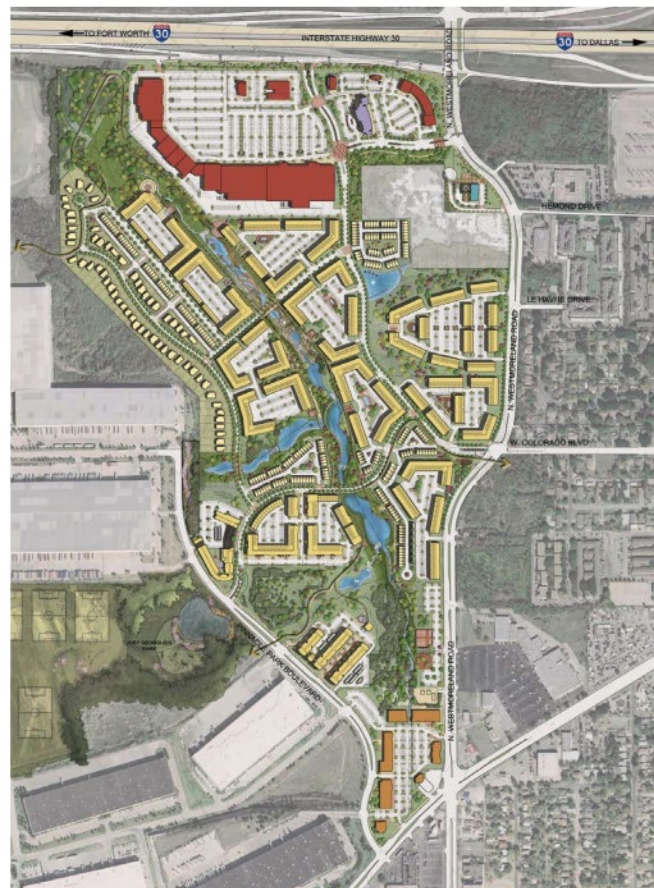
The Canyon in Oak Cliff - Conceptual Site Plan