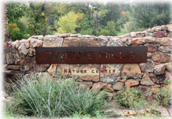
Exhibit A Davis Garden TIF District FY 2021-2022 Annual Report