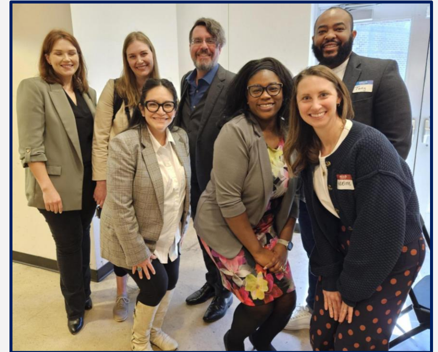
Senior Services Strategic Plan Consultants: Guidehouse and CoSpero Consulting with Age-Friendly Senior Services staff