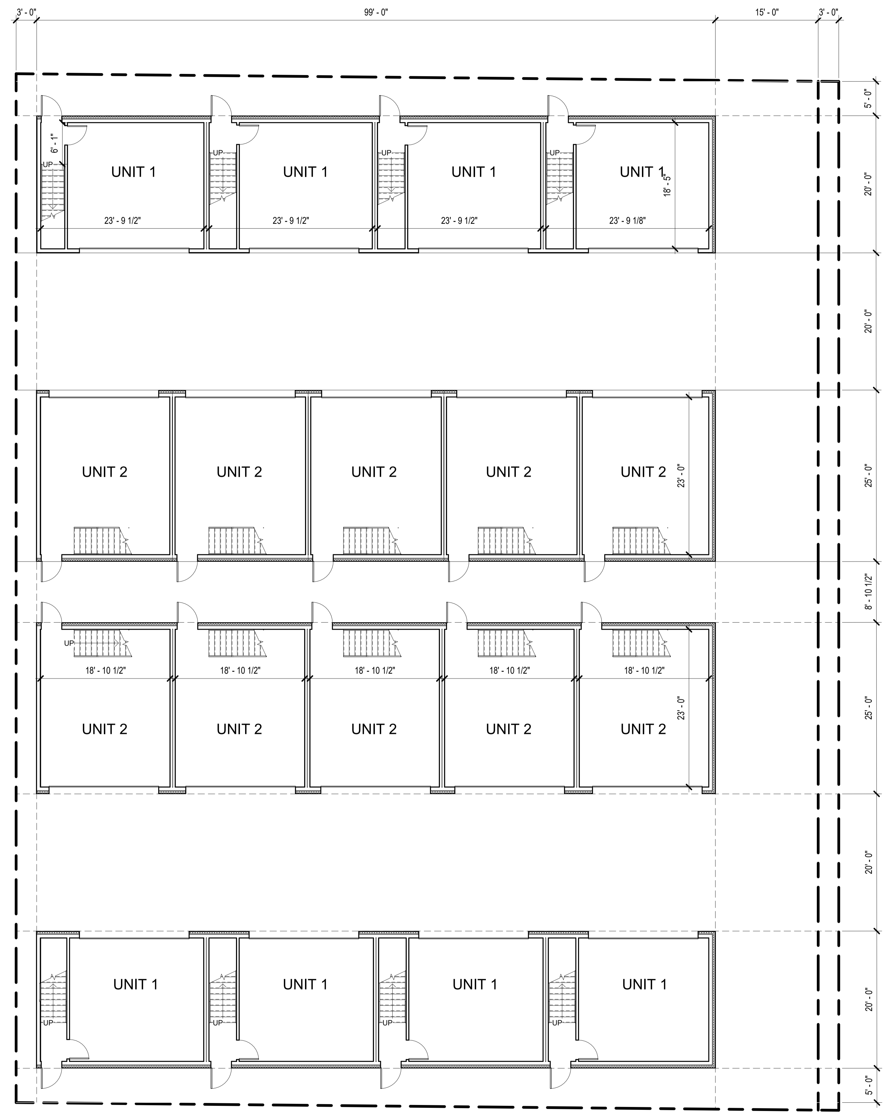
1 SITE PLAN 1/8" = 1'-0"