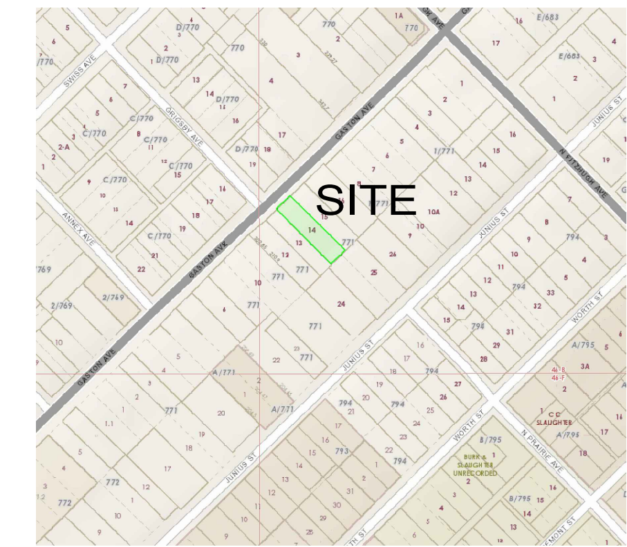
VICINITY MAP NTS