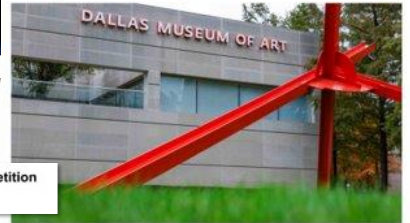
The Dallas Museum of Art announces Thursday a design competition for its campus in the Arts District. A first stage of massing is due March 16, from those wishing to be considered for the job.

The DMA will consider potential architects from around the world, museum officials for a project budgeted at $150 to $175 million.