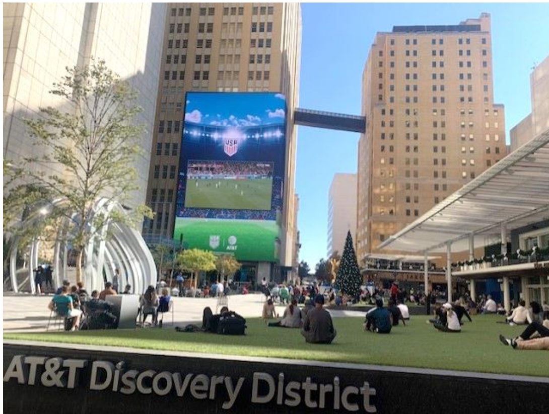
Exhibit A City Center TIF District FY 2021-2022 Annual Report