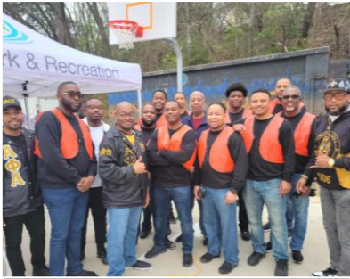
South Oakcliff Alumni Bearcave @ Renaissance