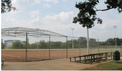
Dallas Classic Baseball Jamestown Baseball Field