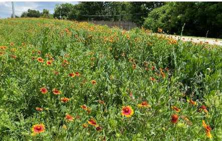
Northaven Trail Butterfly Garden