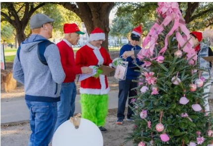
Friends of Exall Park Holiday in the Park @ Exall