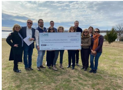
White Rock Lake Foundation White Rock Lake @ Winfrey Point