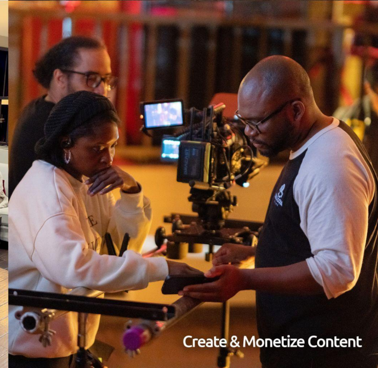
Create & Monetize Content