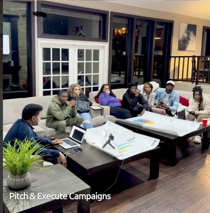
Pitch & Execute Campaigns