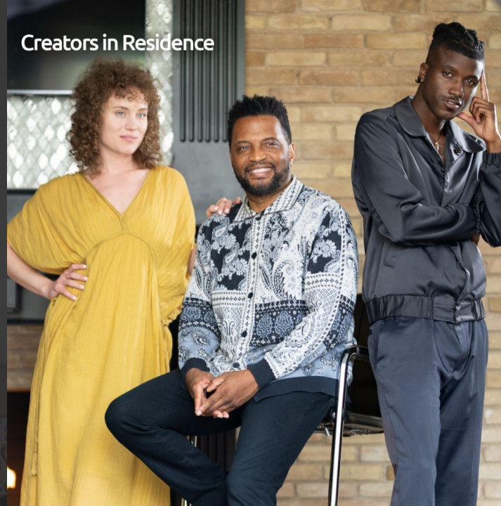
Creators in Residence