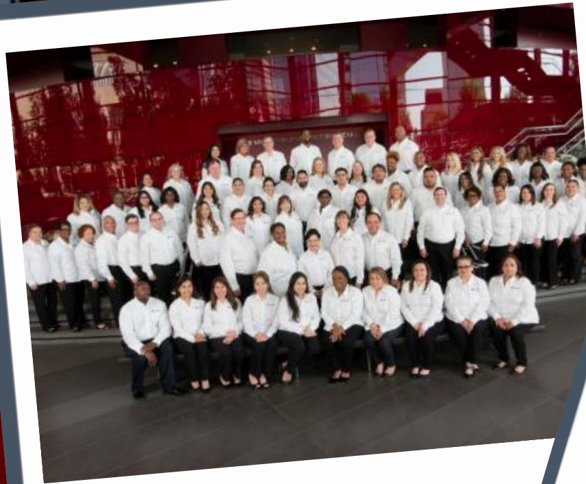
Our Dallas Team

Linebarger was established in 1976. Nationally, our firm is composed of over 1,000 employees, 120 attorneys, 160 information technology specialists and 280 call center personnel.