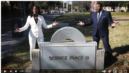
Figure 3 – Dallas Fire-Rescue Chief Dominique Artis on Holiday Fire Safety