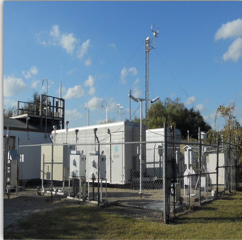
Dallas Hinton Air Monitoring Site