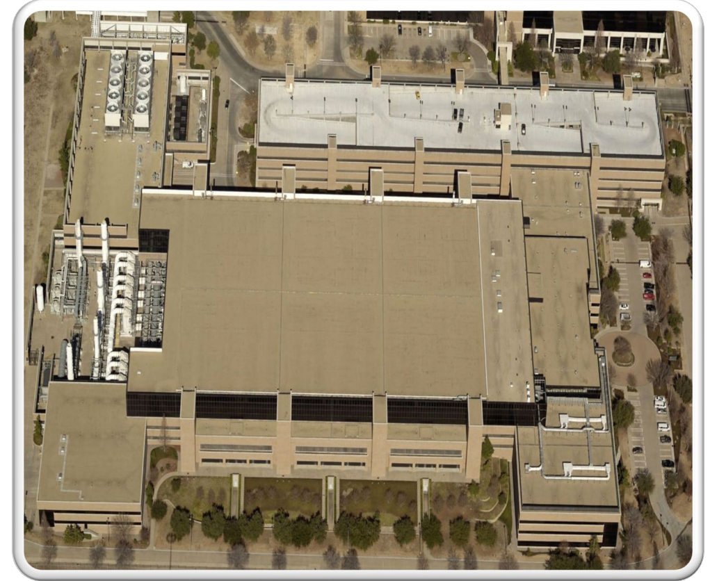
Texas Instruments – Dallas Campus