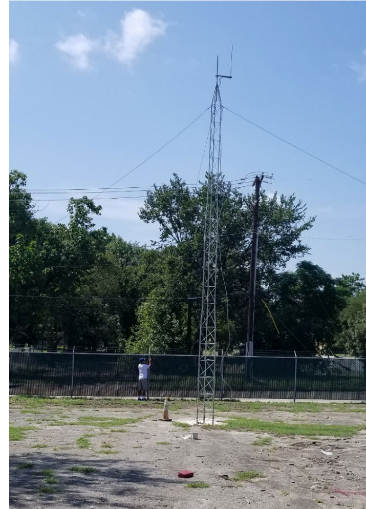
Dallas Bexar Site (Bonton) Meteorological "MET" Tower