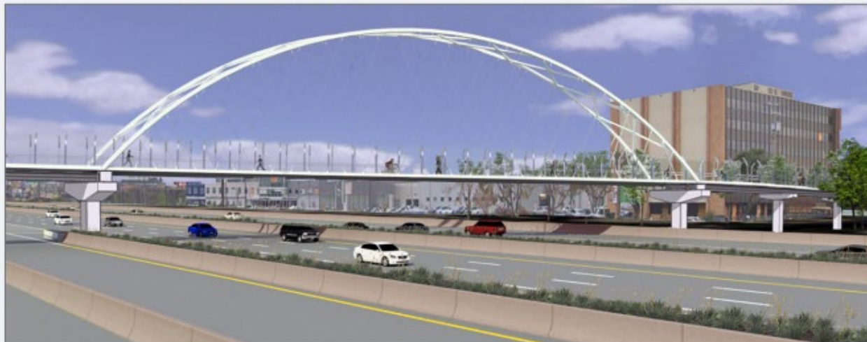
Preliminary renderings of the Northaven Trail Bridge over US 75