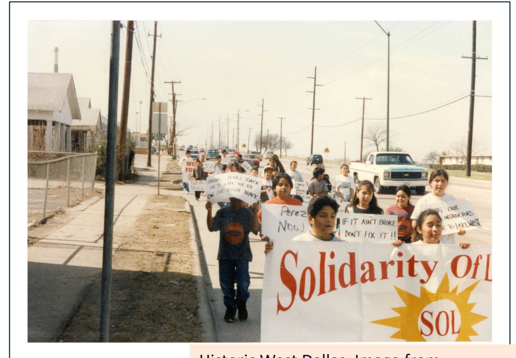
Historic West Dallas.