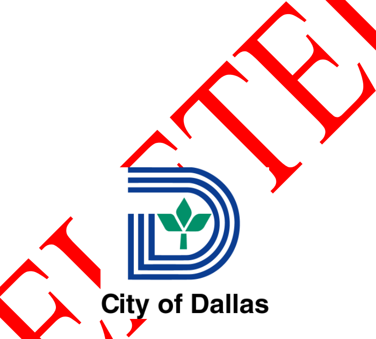
EXHIBIT A Urban Land Bank Demonstration Program Plan Fiscal Year 2022-23

Department of Housing and Neighborhood Revitalization 1500 Marilla Street Room 6CN Dallas, Texas 75201