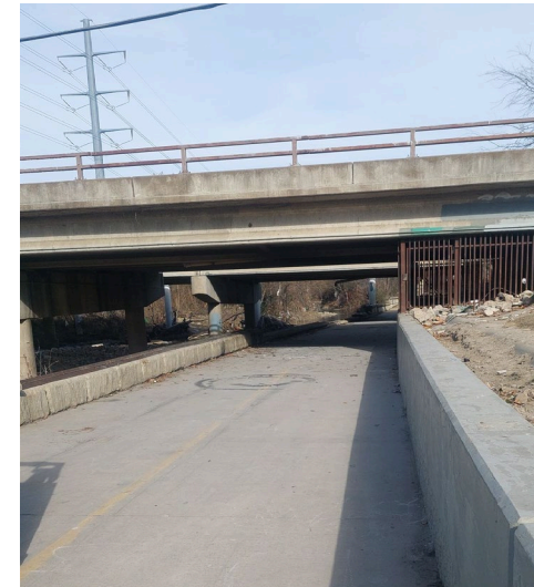
Cottonwood Trail at Forest Lane Overpass