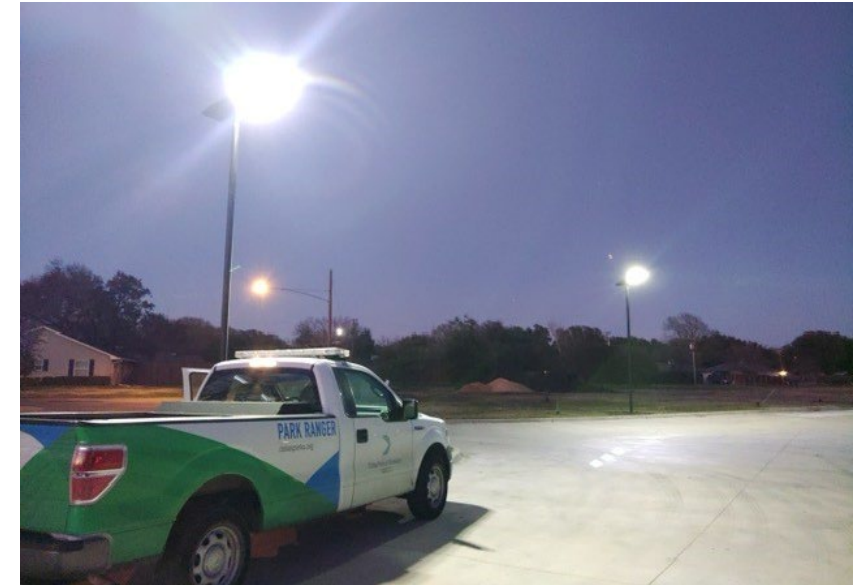
Solar Lighting Installation Northaven Trail – Pensive Trailhead