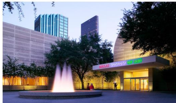
The Dallas Museum of Art