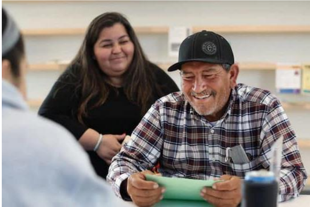
Citizenship Workshop at Vickery Park Branch Library September 2022