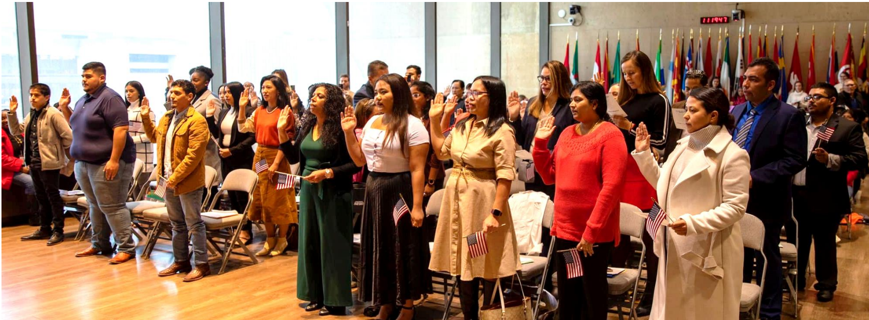
Naturalization Ceremony with residents from over 30 different countries at Dallas City Hall June 2022