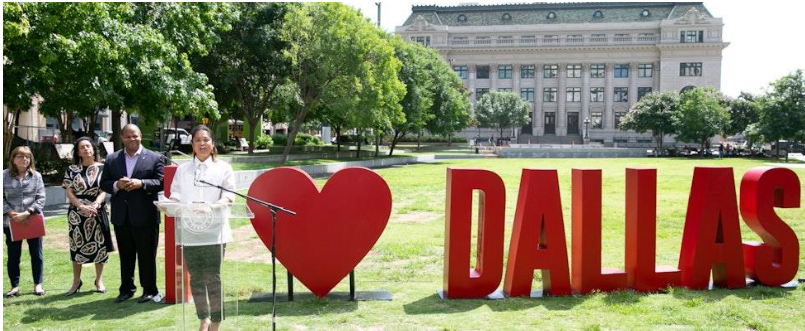
Immigrant Heritage Month Proclamation, June 2019