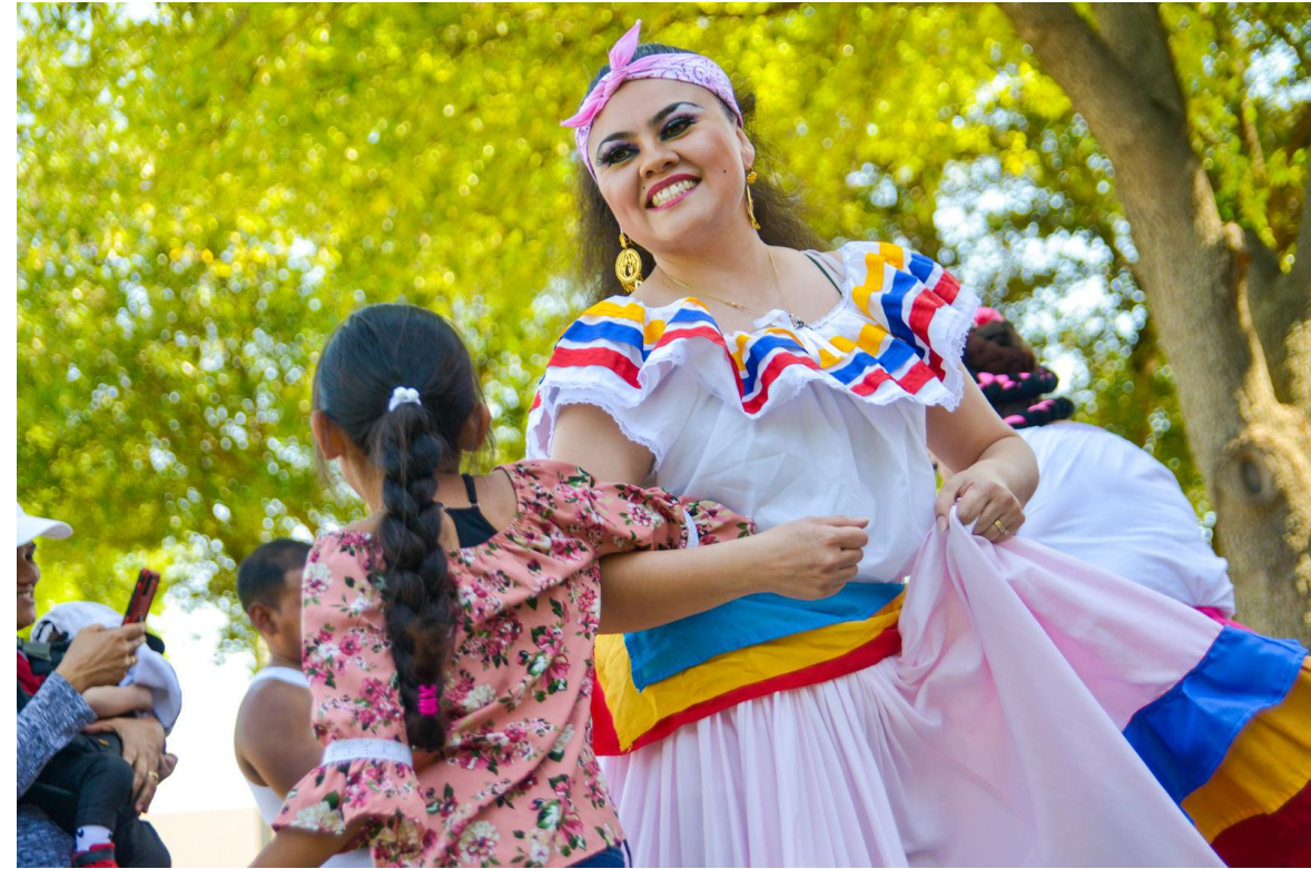
Dist. 11 Día del Niño/Children's Day Celebration April 2023

Begin working with Welcoming Taskforce to develop strategic planning process for Welcoming Plan 2.0