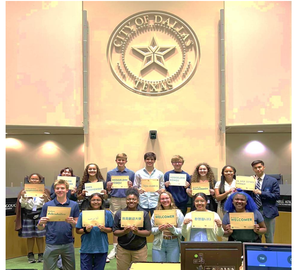
City of Dallas Youth Commission sharing multi-lingual welcoming messages during Welcoming Week 2022

More information about WCIA's initiatives has been published on the Welcoming Dallas Strategic Plan Dashboard