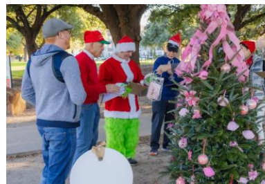
Friends of Exall Park Holiday in the Park @ Exall