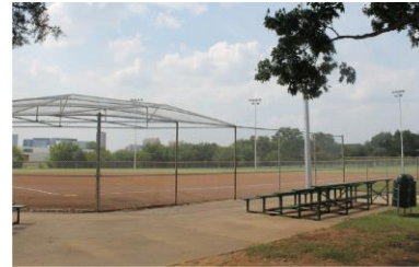
Dallas Classic Baseball Jamestown Baseball Field