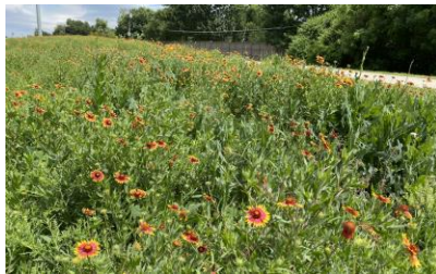
Northaven Trail Butterfly Garden