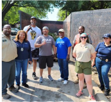
South Oak Cliff Alumni Bearcave Deerpath