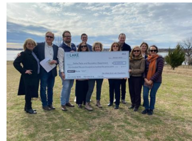
White Rock Lake Foundation White Rock Lake @ Winfrey Point