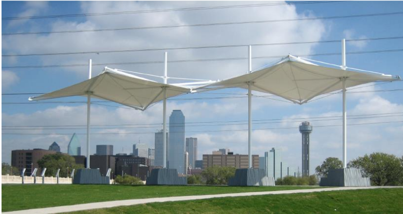
The Trinity Overlook