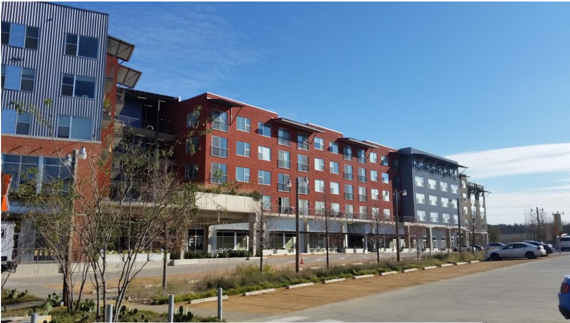
Sylvan I Thirty