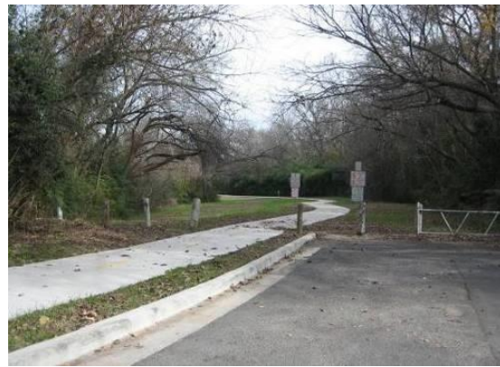
The Coombs Creek Trail