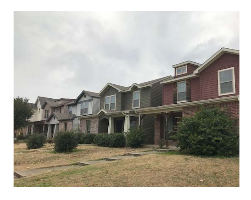
Fair Park Estates single-family homes

In Spring 2018, City Council adopted a new Citywide comprehensive housing policy. Future development in the Grand Park South area has the potential to support goals for expanding housing opportunities.