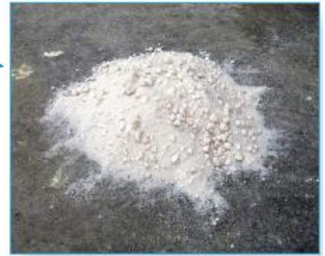
Liquid Salt (used before event)

During an ice/snow event , they use various salt-based granular de-icers to help melt ice that has already formed on the road.