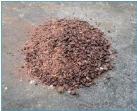
Granular De-Icer (used during event)