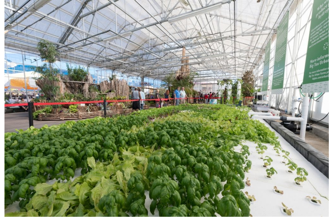
BigTex Controlled Environment Farming Operation