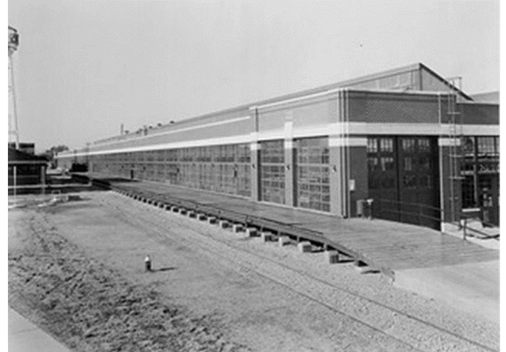
Ford Auto Plant