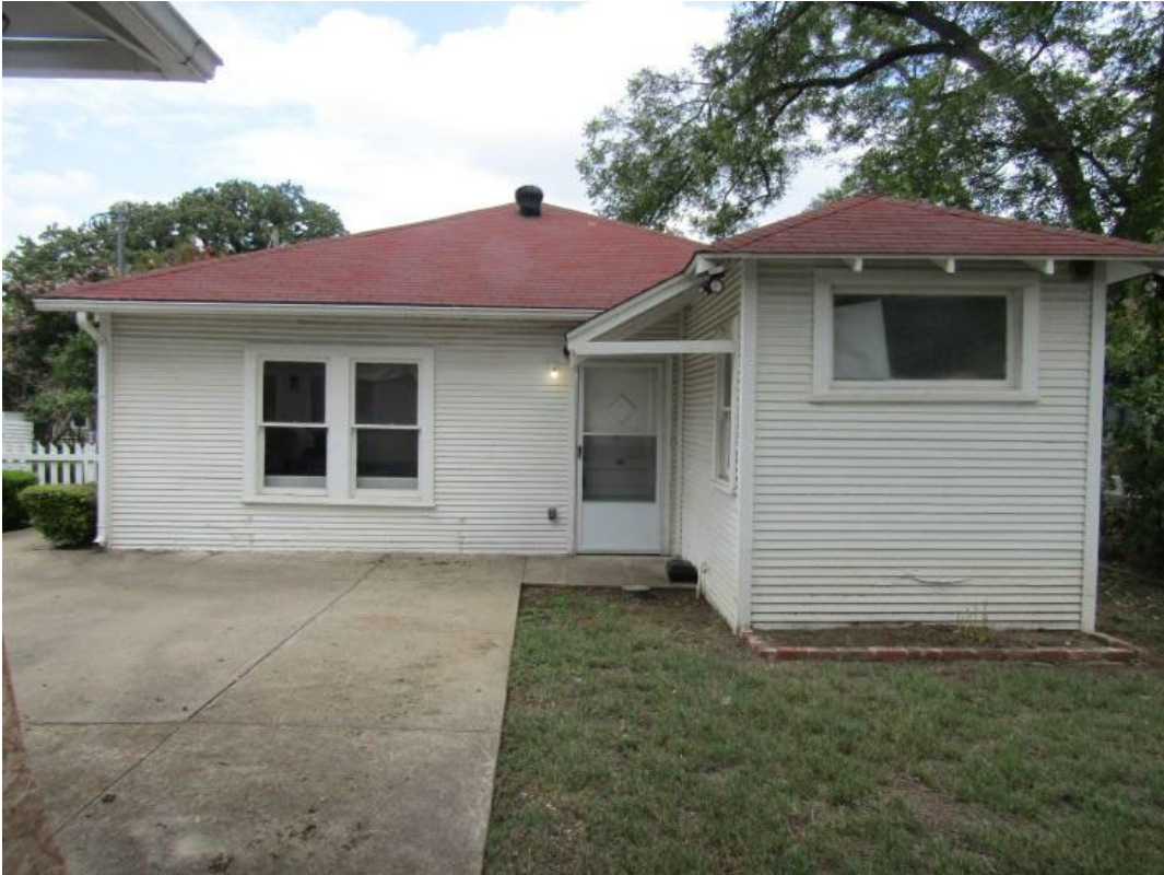
Rear of home