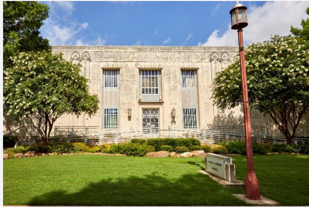
Natural History Building

Fair Park First and Spectra have secured over $65 million in private equity and investments to date for 3 occupied buildings on Fair Park's campus.