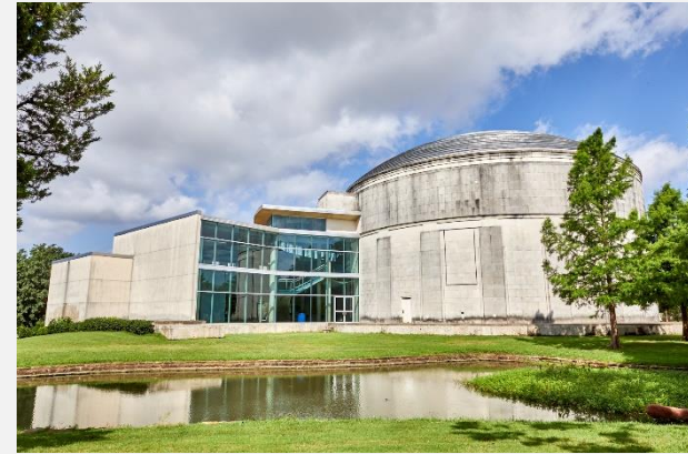
Science Place 1