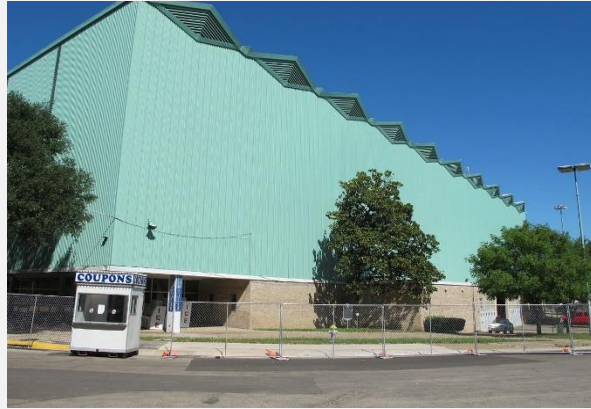
Fair Park Coliseum