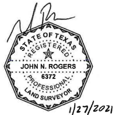
Exhibit map attached and made a part hereof.

Bearings are referenced to State Plane Coordinate System, Texas North Central Zone 4202, North American Datum of 1983. Adjustment Realization 2011.